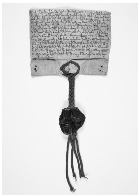
King John's Charter 1212

Queen Elizabeth School, Godmanchester, Cambridgeshire