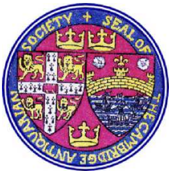
Cambridge Antiquarian Society

The Conduit 2008 is jointly published by the Cambridge Antiquarian Society and the Cambridgeshire Association for Local History in association with the Huntingdon Local History Society