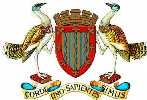
Cambridgeshire Association for Local History