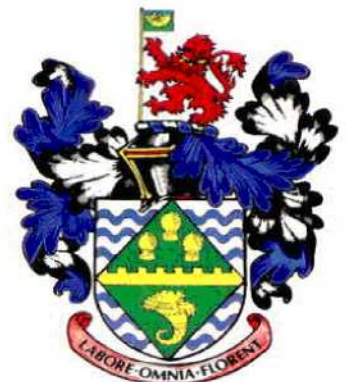
Huntingdonshire Local History Society