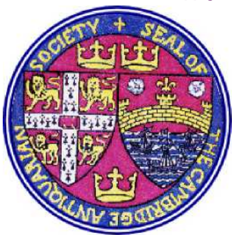
Cambridge Antiquarian Society

The Conduit 2008 is jointly published by the Cambridge Antiquarian Society and the Cambridgeshire Association for Local History in association with the Huntingdon Local History Society