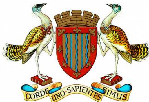
Cambridgeshire Association for Local History