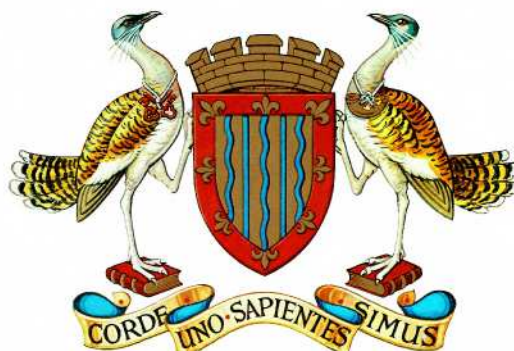
Cambridgeshire Association for Local History