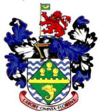
Huntingdonshire Local History Society